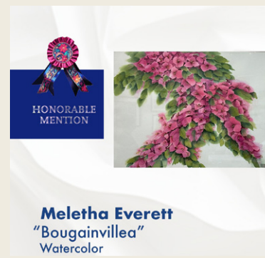
Meletha Everett "Bougainvillea" Watercolor