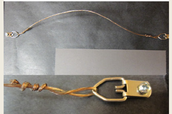
Proper framing hardware.