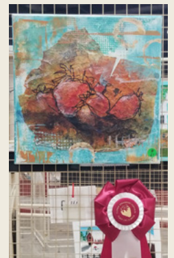
Strawberry Theme Beth Smedley