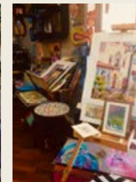
Place to sell and display art