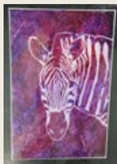
3rd place Decorative Arts - Zebra