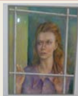
2nd place Fine Arts - Waiting