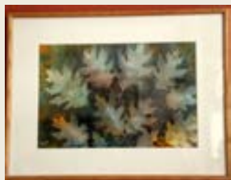
1st place Decorative Arts - Autumn