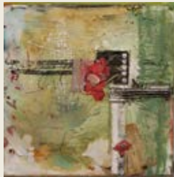
HM Beth Smedley No 220