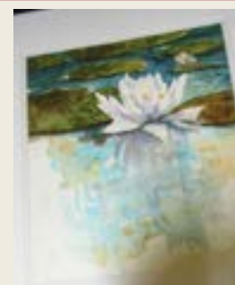
HM Decorative Arts - Lovely Lotus