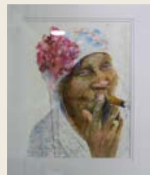
1st place Decorative Arts - Portraits Havana