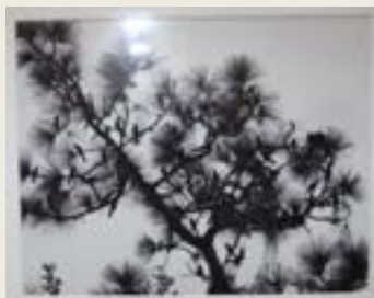
HM Photography - A Plague of Grakles