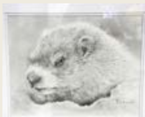
2nd place Decorative Arts - Springtime?