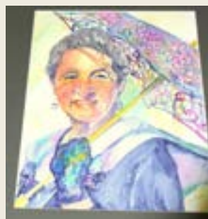
1st place Decorative Arts - St Pete Sunset