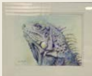
1st place Decorative Arts - Godzilla