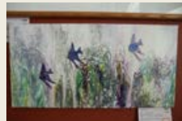
HM Decorative Arts - Fish in Space