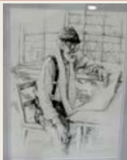
1st place Fine Arts - Morning News