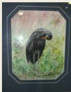
3rd place Fine Arts - Lampkin