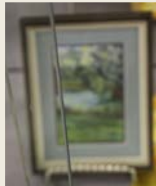
HM Peggy Little Ron's Pond