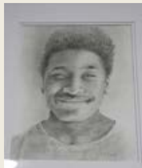
1st place Decorative Arts - Portraits Sully