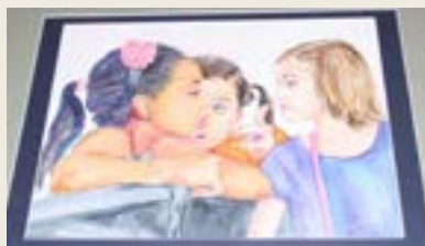
3rd place Decorative Arts - Girl Talk