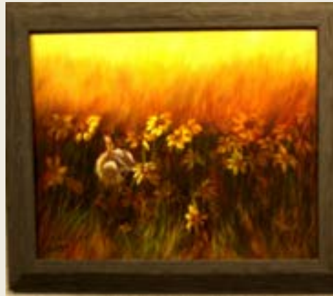
2nd Place Eva Bejar Of Mice & flowers